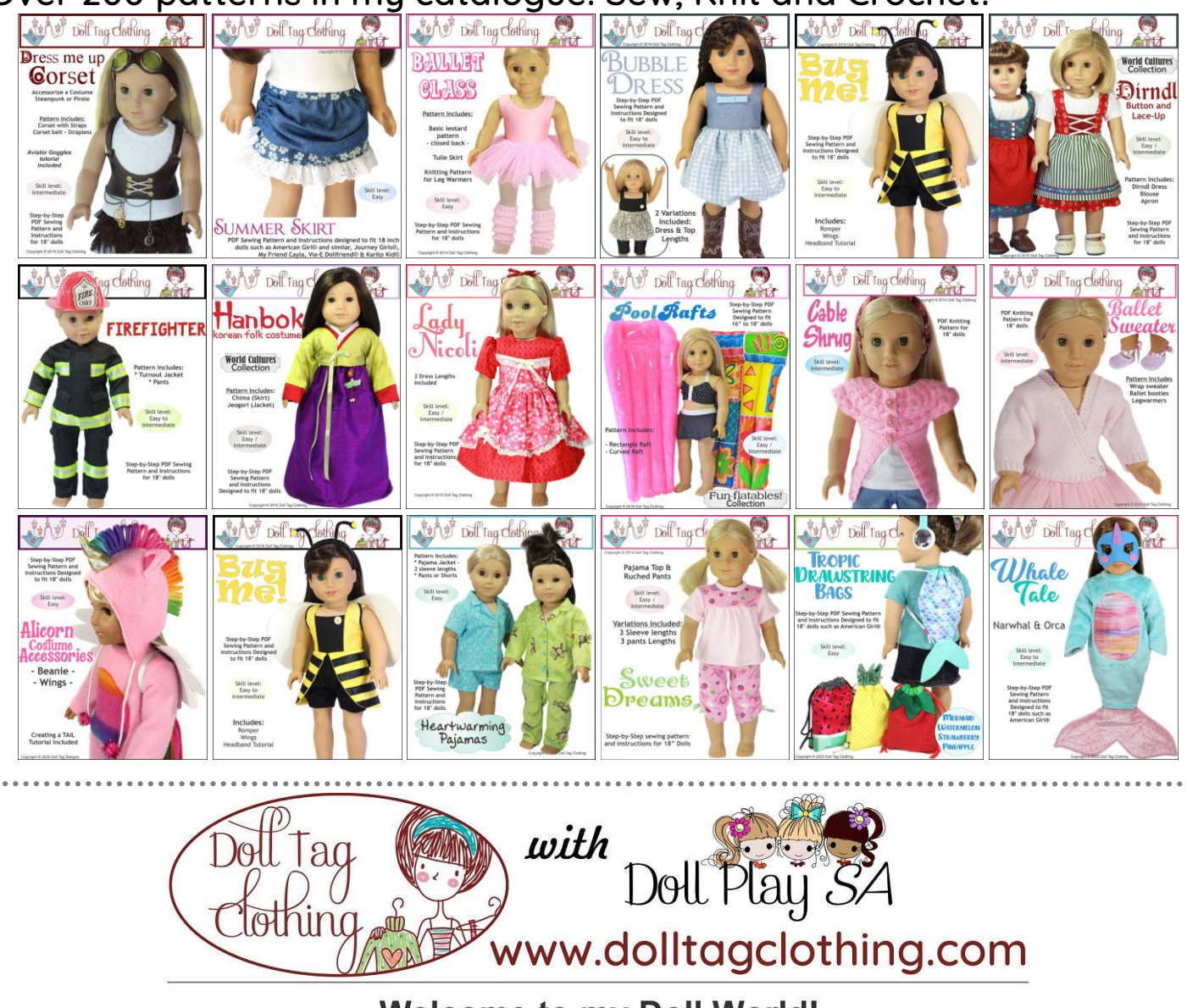
Welcome to my Doll World!